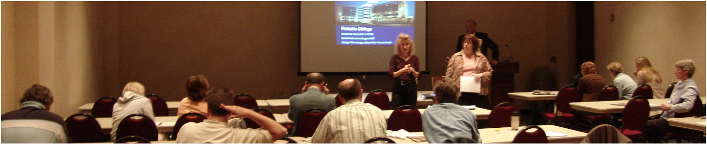
There was good attendance at the Fall NDAAP meeting on September 23, 2005. See you at the spring meeting February 17th in Fargo.